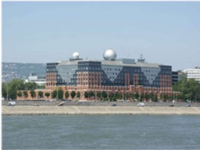
Northern building (room codes like: LÉ -1-22; LK -3-66)